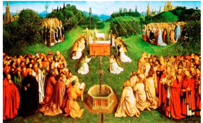
The Son of Man did not come to be served, but to serve. (Mark 10:45)

Commencing in February 2023, the Catholic Archdiocese of Sydney, Liturgy Office, is offering a series of training courses for adult lay people to serve their parishes in liturgical ministry. These courses include training for: