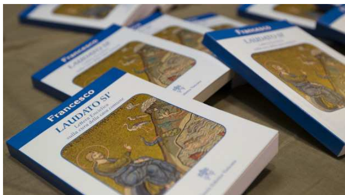
Copies of Pope Francis' encyclical 'Laudato Si (Praise Be)' are displayed prior to the start of a press conference, at the Vatican.

Here are some of the key passages people will read closely, everything from climate change and global warming to abortion and population control.