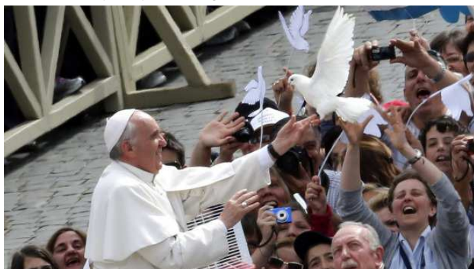
Taking a stand on the environment... Pope Francis holds a dove before his general audience at San Peter's Square at the Vatican on Wednesday.

10 Key Excerpts from Pope Francis' Encyclical on The Environment Sydney Morning Herald 19 June 2015