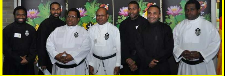
Papua New Guinea