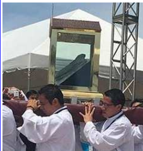
A Relic of Blessed Oscar: the shirt he wore when he was murdered.

The beatification of Archbishop Oscar Romero is a watershed moment in the recovery of a fundamental truth. The key question that Romero's life and death asks of the faithful everywhere is whether the Christian duty to evangelise and the Christian calling to be holy are inseparable from the Christian duty to work for a better world by opposing exploitation and injustice. The easy answer, from generations of church leaders and teachers, was to treat the work for justice as optional, admirable, but not for everyone. That is no longer tenable.